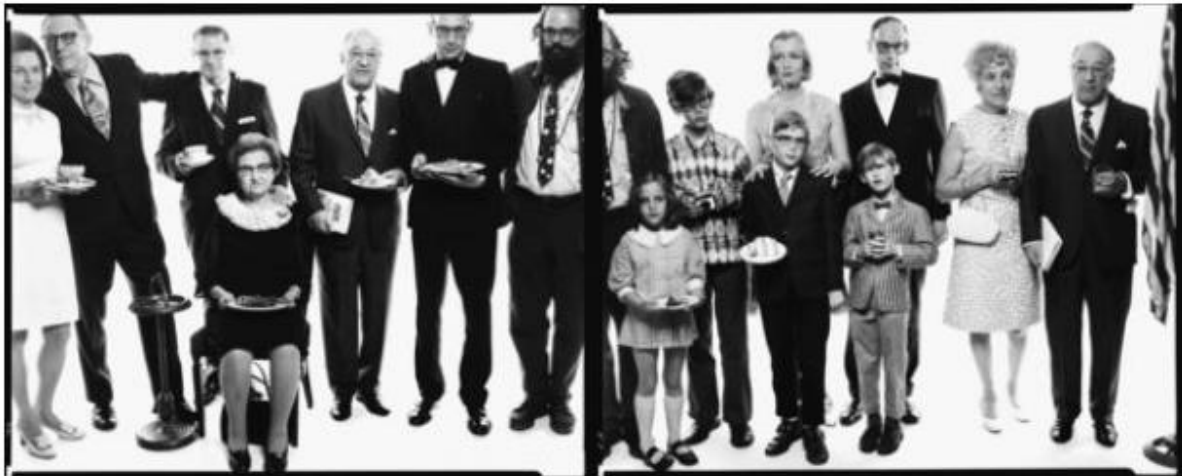
📍 At the National Museum of American Jewish History, Richard Avedon: Family Affairs examines many of Avedon's photographic portraits.

and early 20th centuries, Durand-Ruel played an enormous role in the rise and success of the Impressionist movement. The savvy businessman organized shows for some of the genre's best-known talents, and this groundbreaking exhibition features works by such masters as Monet, Renoir, Degas and Cassatt. Through a selection of pieces from collections housed all over the world, Discovering the Impressionists tells the story of this enterprising dealer who helped change the art world forever.