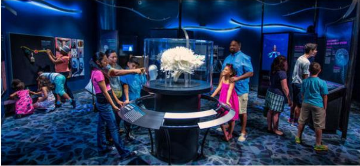
Philadelphia's Franklin Institute this month has an exhibit that is a tribute to LEGO bricks.

Feb. 7 - Sept. 6: In line with its proven track record of making science fun and acceptable, the Franklin Institute (222 N. 20th St., Philadelphia, 215.448.1200) presents The Art of the Brick , an exhibit dedicated to one of the world's favorite toys: LEGO bricks. Kids of all ages can enjoy this display, which features more than 100 creations designed and assembled by artist Nathan Sawaya. Pieces include a 20-foot-long Tyrannosaurus Rex skeleton, three-dimensional interpretations of classic works, including Munch's "The Scream" and Da Vinci's "Mona Lisa", and reproductions of iconic landmarks such as the Easter Island statues. Keep an eye out for Sawaya's LEGO-made Liberty Bell, created especially for Philly.