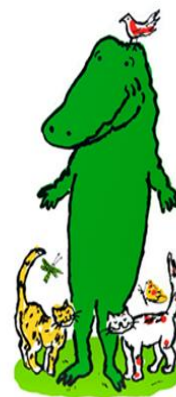
Lyle, Illustration © 1969 by Bernard Waber

Fall is upon us and the National Museum of American Jewish History continues its vibrant assortment of programs, including events associated with its special exhibition, Lyle, Lyle, Crocodile & Friends: The Art of Bernard Waber . The exhibition, open until November 1, tells the story of the life and career of children's book writer and illustrator, Bernard Waber (1921-2013). Please see below for programs related to this whimsical, family-friendly exhibition, and for many other public programs to enrich your fall season.